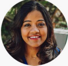
Archana Subramanian - COO of Salesforce